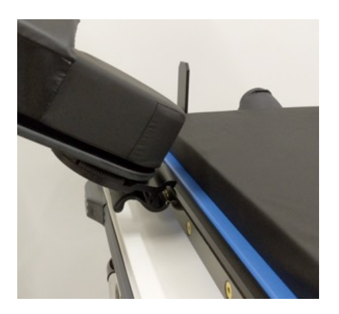
Arm Board with Cushion